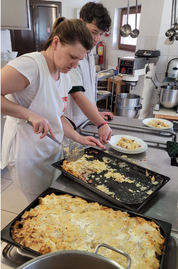
▲ the second course is being prepared for the residents of Saint Elisabeth Elderly Home in Oradea

lei. As part of the winter aid program funded by the SOEB foundation, the Oradea canteen also prepared hot meals distributed on the streets once a week for 12 weeks.