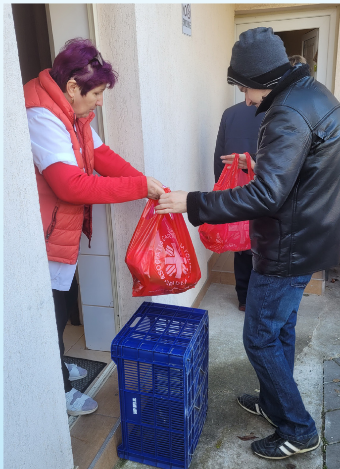
▲ on holidays, we offer sustainable food packages to registered beneficiaries at the Social Kitchen

In addition to providing daily meals for those in need, throughout 2023, we distributed food donations 71 times to individuals, war refugees from Ukraine, and social institutions, with a total value of 98,203