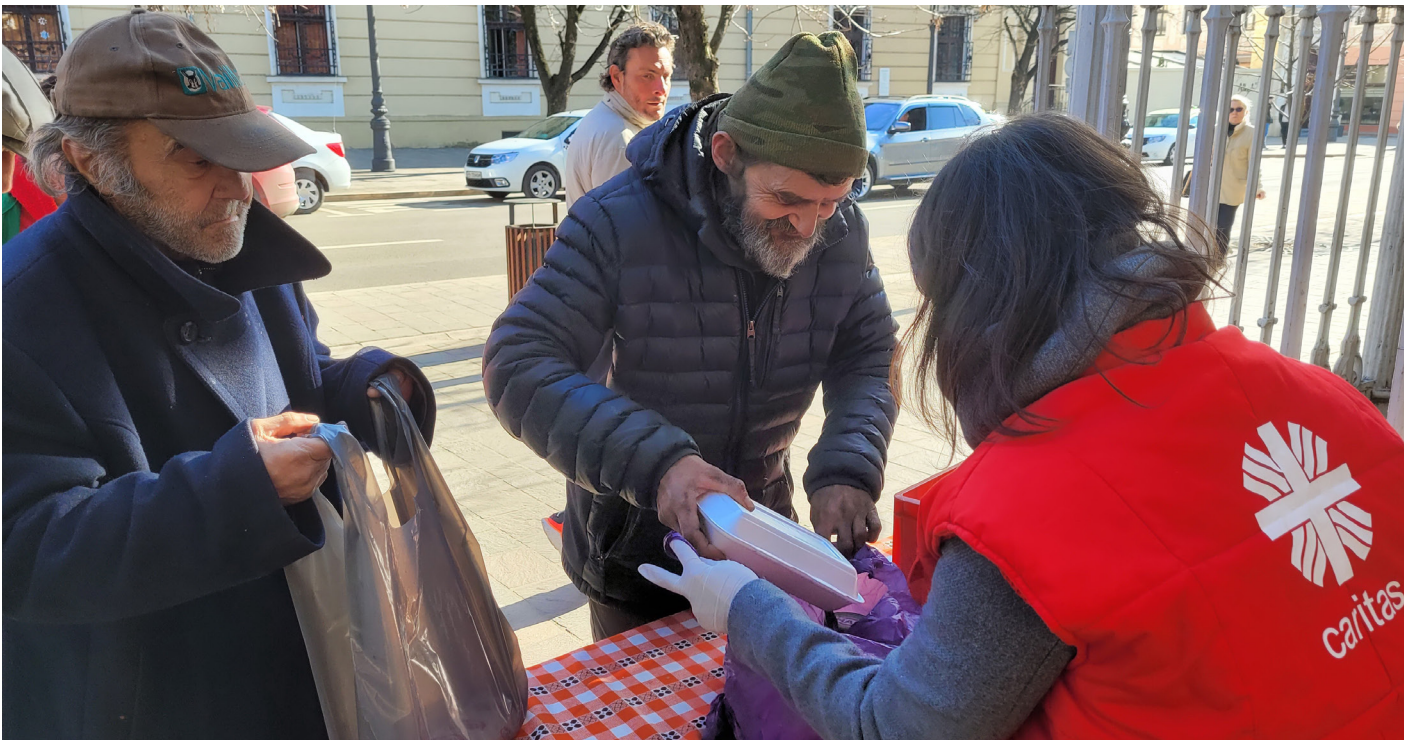
Snapshot from street distributions of free hot meal - program funded by SOEB Foundation from the Netherlands ▲

To continue our work under optimal conditions, we need a four-burner electric stove and a 150-liter industrial marmite. We would greatly appreciate any assistance in this regard.