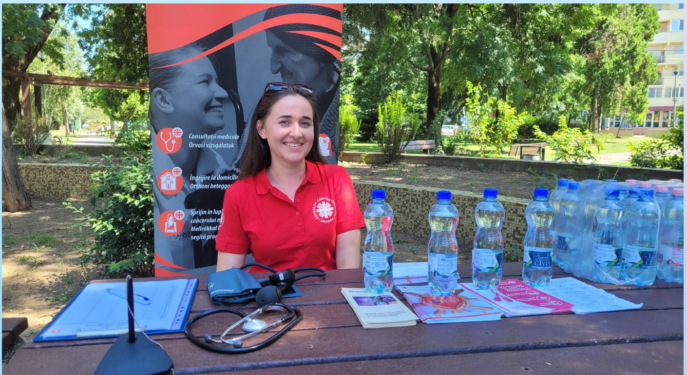
▲ The staff of our home care service offered the public free blood pressure measurement in Olosig Park in Oradea between August 1 and 6, 2023.