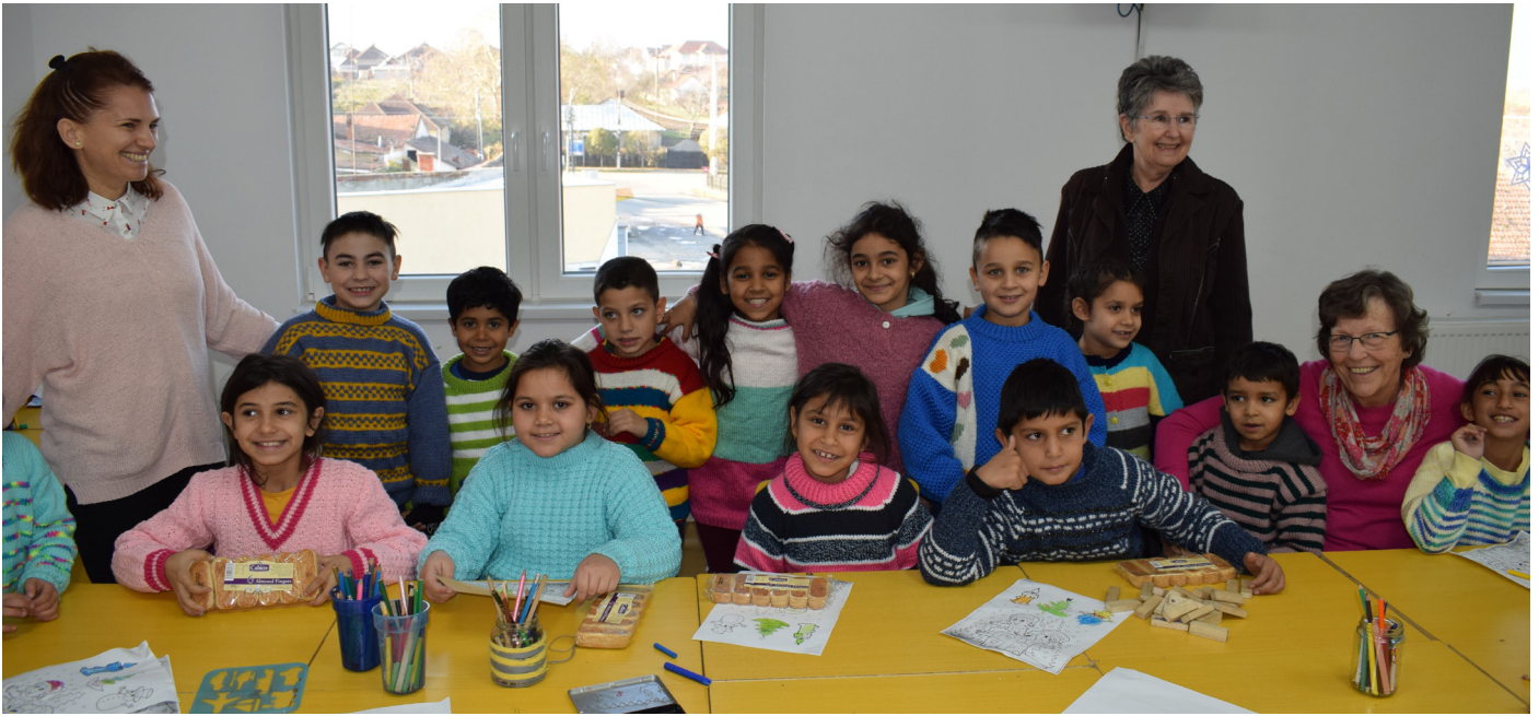
▲ The youngest group of students participating in the afterschool program, together with teachers and program sponsors spiritual retreats, family reunions, and charity balls.

Counseling and Support Center for Disadvantaged Children and Parents – Helps Roma children catch up with their studies. Located above the multipurpose hall, the center was funded by European grants and has been operational since 2023. The center provides study rooms, a dining hall, toilets, and changing rooms. An average of 30 children come daily, enjoying 7,200 meals annually. Activities include help with doing homework, personal hygiene development, music programs, and recreational activities, all supported by teachers and volunteers. A key goal is to reduce school dropout rates, collaborating with Tășnad Primary School and financially supported by local authorities and a local entrepreneur.