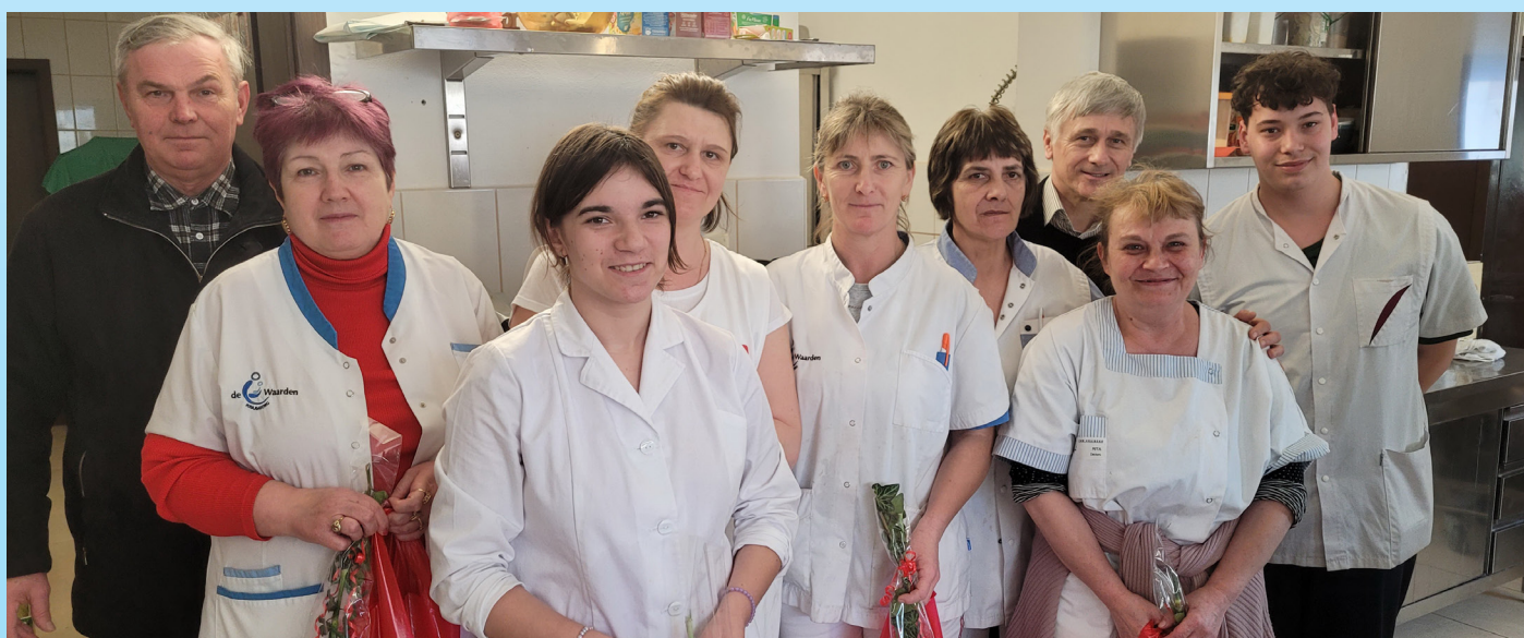
▲ We greeted our female colleagues from the kitchen with a bouquet of flowers on March 8.