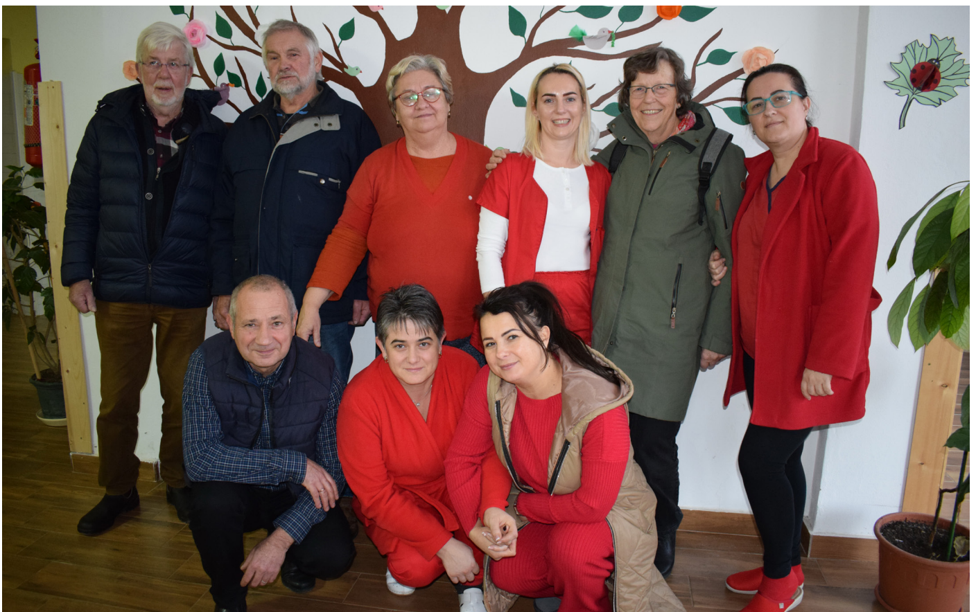
▲ Caritas Marghita team together with sponsor representatives from SOEB Foundation, the Netherlands

The objectives for 2023 were achieved. This is evident from the individualized care and assistance plans in each beneficiary's file, the 2023 development plan, satisfaction questionnaires filled out by beneficiaries, the absence of complaints, high occupancy rates, and numerous requests confirming the high quality of services provided at the homes.