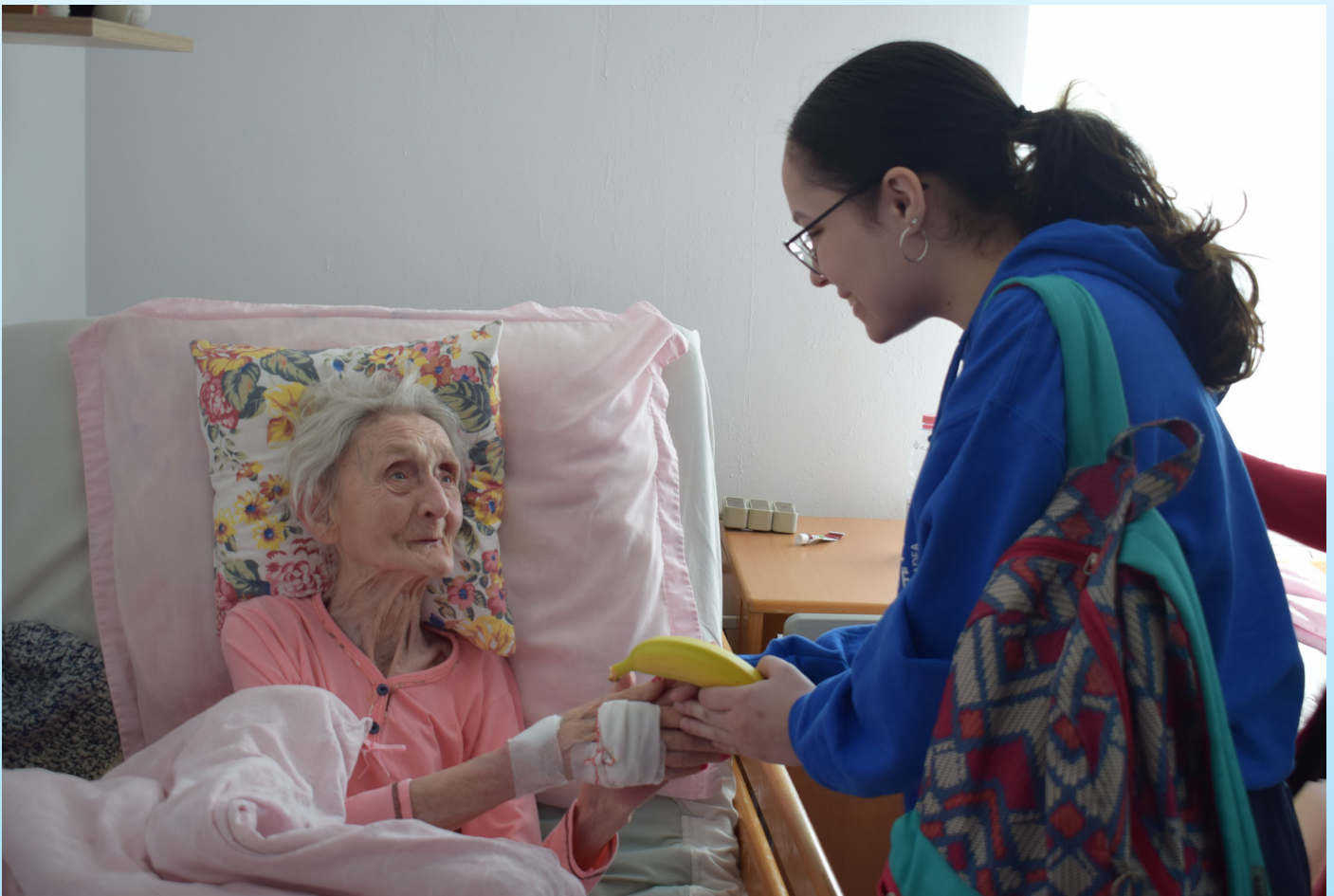
▲ volunteers from the Netherlands visit institutionalized elderly - St. Anthony's Home, Marghita - 2023

“The ultimate test of your greatness is how you treat every human being” – Pope St. John Paul II.