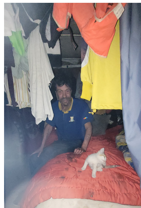
▲ A community of homeless people (10 pers.) who moved into a ruined and abandoned building in Oradea, helped by Caritas with food and clothing